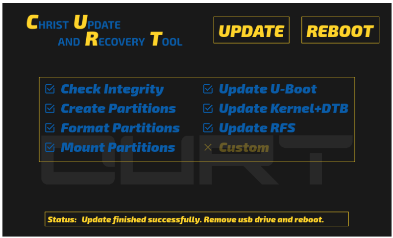
Figure 2: CURT after successful update

4. Click on UPDATE start the update process. Successfully completed tasks are indicated in blue with a check mark, a red cross indicates an error. Grayed out tasks with a cross were disabled in the update configuration. For more information see chapter 3 "Yocto Configuration" . Figure 2 shows CURT after a successful update process.